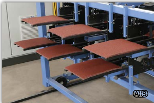
Stacks are ejected ready for packing