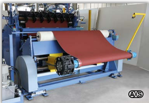
Optionally available: Shaftless unwind station type 366 for an ergonomic handling of jumbo rolls