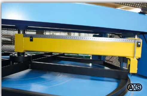
Large clamping discs for a diameter of 1200 mm