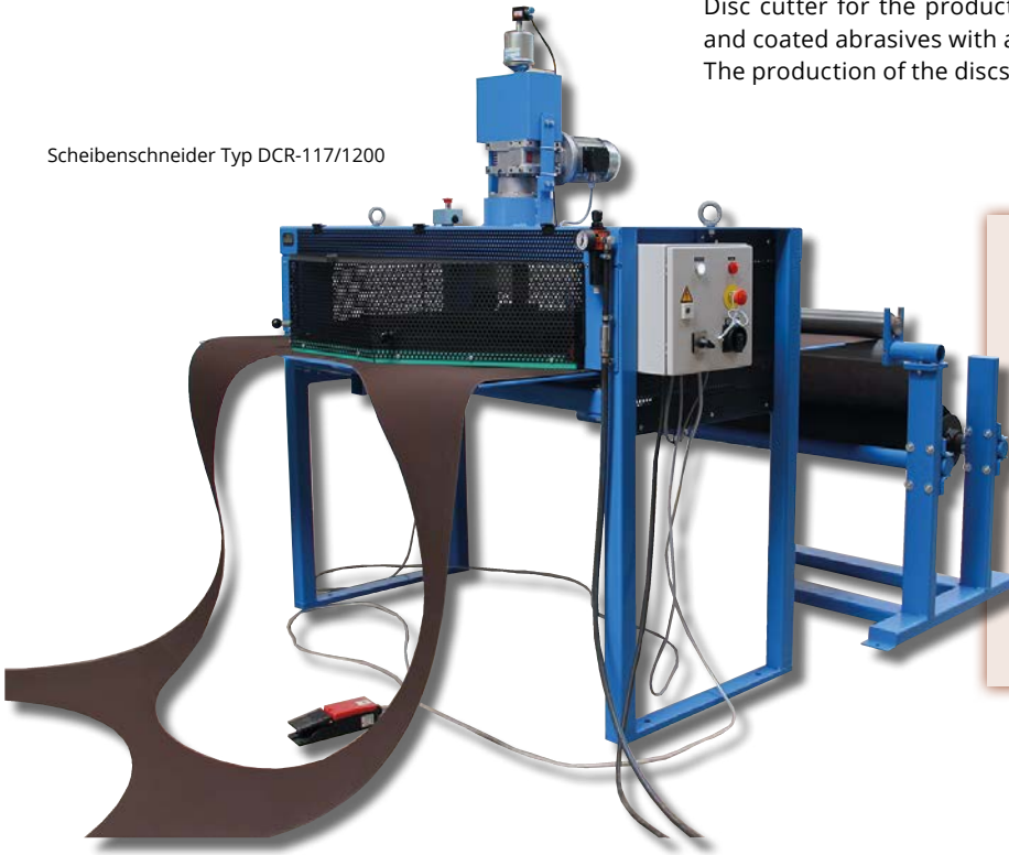
Scheibenschneider Typ DCR-117/1200

Disc cutter for the production of large discs (without center hole) of flexible and coated abrasives with a maximum diameter of up to 600 mm or 1200 mm. The production of the discs occurs directly from the abrasive rolls.