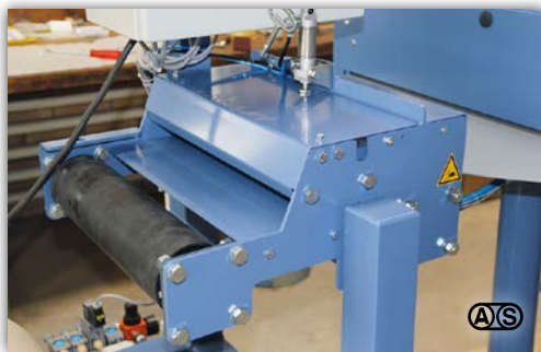
Inlet to feeding