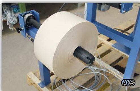
Pneumatic unwind shaft with simple brake